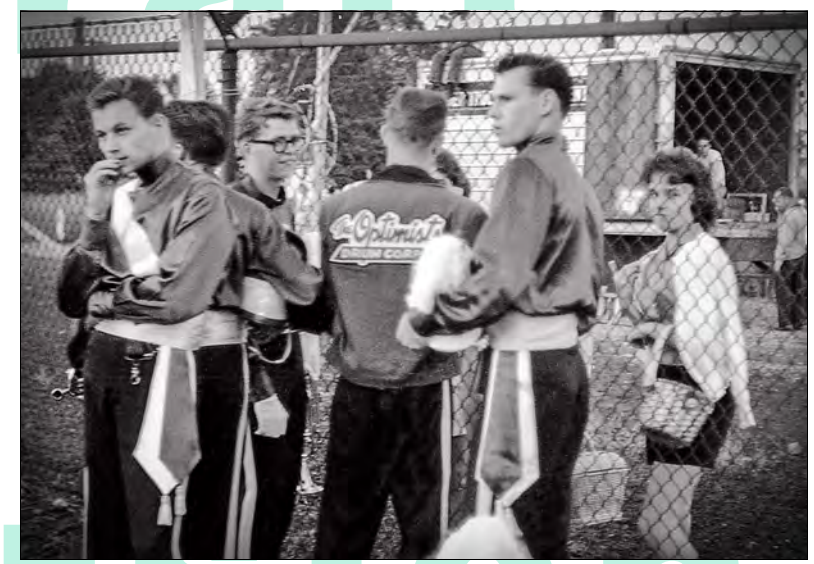
1960: Our author (L) is thinking about meeting local corps fans (Rochester)

For the Corps itself, activity began quite early. Again, we performed at the Ice Follies, on January 30, at Maple Leaf Gardens, and on February 28 participated in a standstill contest. This was in Rochester, New York, and was a senior versus junior affair, with us being the only Junior Corps involved. The Optimists were not very good that night, placing third, although the Senior Corps were of a good calibre. There was more reason for our mediocre performance than the early date. It was a sign of the