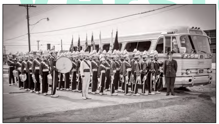
1961: Toronto Optimists in promo shot for Gray Coach Lines

The first evidence of this was the choice of a new off-the-line number, to replace the excellent "Meadowlands" of the previous year. It had been suggested that we should play the tune "Cockeyed Optimist", mainly, I suppose, because the title contained the word "Optimist". It