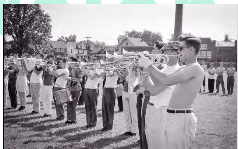
1960: Toronto Optimists rehearsing (Rochester, NY)