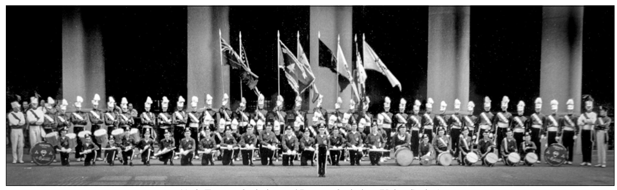
1960: Toronto Optimists and Bantam Optimists (Union Station)

There were no immediate signs that the coming year would be any different from the others. When practices began again in the late fall, things were upbeat and optimistic. The only negative aspect of the situation was the thirteen gaps left by the group that had departed at the end of last season. Out of a total of about fifty members, this is a fairly large number. However, there were more than enough replacements available, so no one was too worried. Worried? Yes. Because we had won so consistently, it was now serious business if anything seemed to threaten this streak. This is one price of success, and it has parallels in other fields of endeavour, such as business, sports, and even National interests.