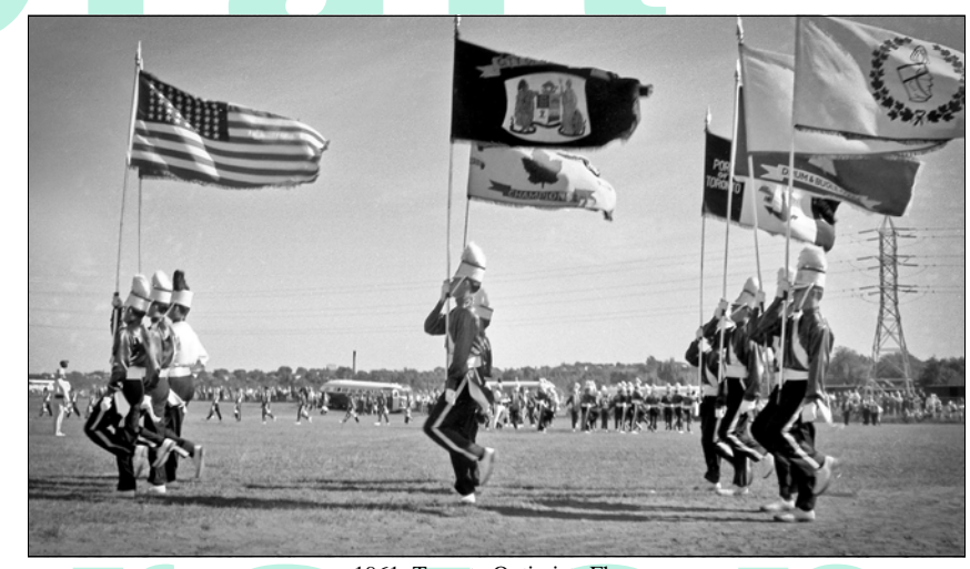
1961: Toronto Optimists Flags