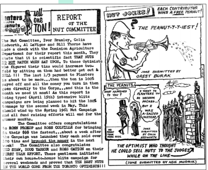
1961: Nut Committee Report & Cartoons

As our sales motto we adopted the phrase: "The best nuts in the world come from the Toronto Optimists Drum and Bugle Corps". The double meanings in this slogan were more than imaginary, but, thus armed and fortified, we set out to try our hands at door to door salesmanship.